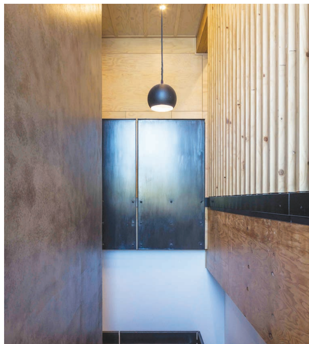
The construction used innovative, locally produced and engineered construction methods for seismic strength utilising timber.

Countdown Nelson, New World Motueka, Fresh Choice Nelson, TW Blenheim and Countdown Motueka