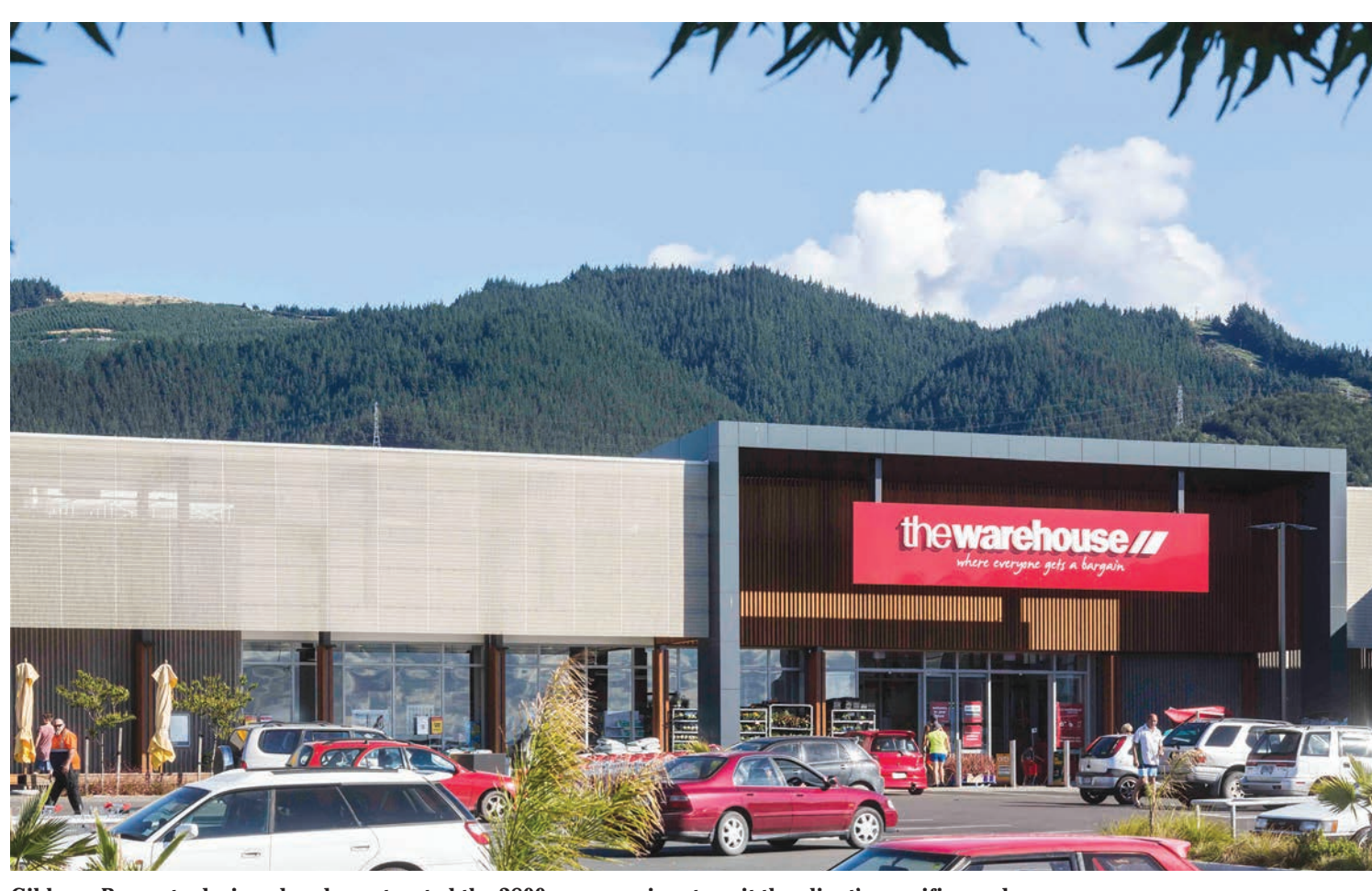
Gibbons Property designed and constructed the 3800sqm premises to suit the client's specific needs.

The Warehouse fit-out is typical and composed of long-span steel portal frames over flat concrete floors.