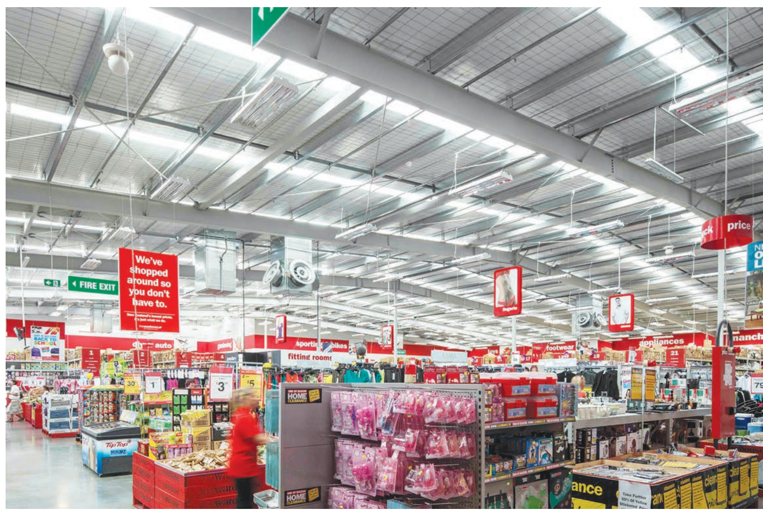
Gibbons Property is Nelson's largest property leasing company offering specialised property leasing options across the commercial, bulk retail and industrial sectors.

This also allows us to apply whole-process thinking to identify innovative ways of reducing costs while still ensuring the long